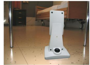
Figuur 1: Sensor Plaatsing

Place the sensor on the floor, facing the bed (figure 1). Make sure that the sensor is placed safely where it can cause no harm to the inhabitant, for example underneath a chair or table. It is highly preferable to place it at a distance of at least 2 meters from the bed. The sensor has a 90 degrees field of view over a distance of approximate 7 meter. Make sure that no objects are in front of the sensor that can block its view (figure 2).