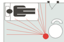
Figuur 2: Kijkhoek Sensor

Note: The sensor will not transmit any alarms in the first 5 seconds after the sensor is turned on. This will prevent falls alarms when the sensor is turned on.