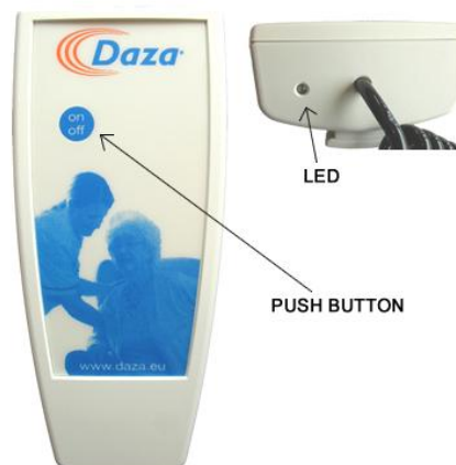
Figure 2: Push button + LED