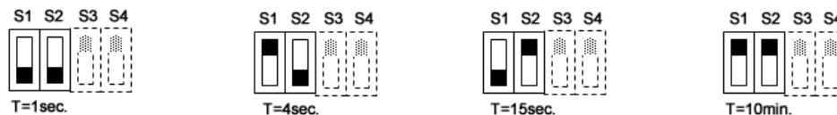
Figure 3: Alarm delay time

The standard delay times you can choose from are: 1, 4, 10 and 255 seconds (other lengths of time are optional). The selection from among these 4 lengths of time is made using the first 2 switches S1 and S2 (figure 3).