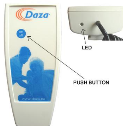
Figure 2: Push button + LED