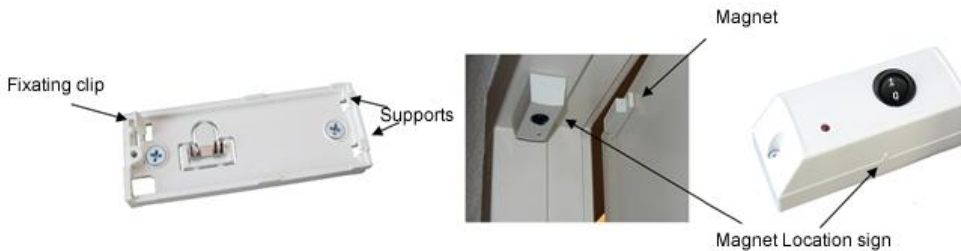
Figure 2: Bottom part